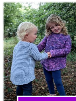
Garter Squish Kids