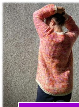
Garter Squish Adult

Why not check out the other Garter Squish patterns?