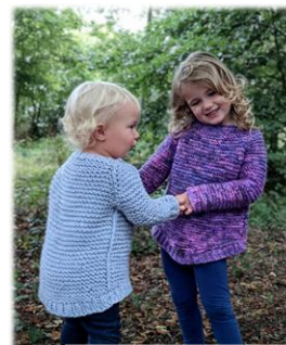
Garter Squish Kids