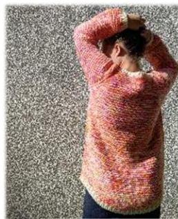
Garter Squish Adult

Why not check out the other Garter Squish patterns?